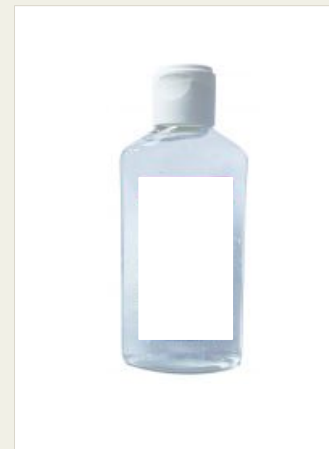
4.25oz Travel Bottle