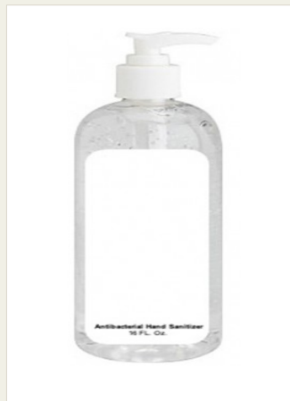
16.9oz Pump Bottle